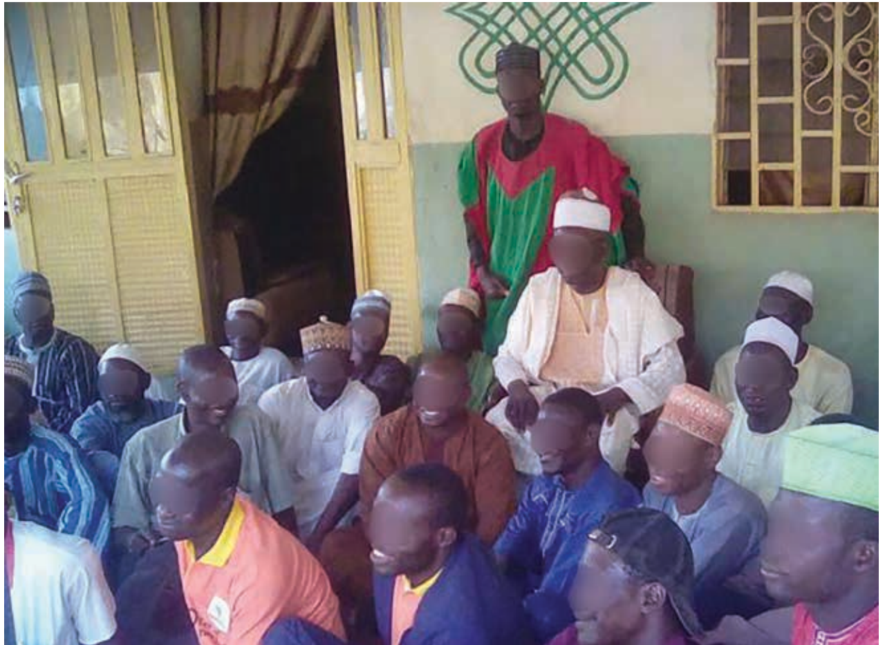
The man seated in the center is the “Sultan” of the area. He not only allowed JESUS to be shown in his historically closed area, but he also offered safety and protection for the film team. This is the result of prayer, obedience and faithful work.