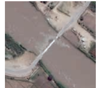
This photo from Google Earth® is a typical bridge in the area, perhaps the same bridge where Vlad and Anton were forced off the road.

As water was still draining out of the unit, they set the player on the tabletop. When they plugged it into the 220-volt outlet, they feared the current would fry the unit. But as before, they felt they had no choice. These people needed to see JESUS !